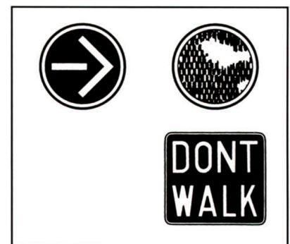
Round and Square Lenses