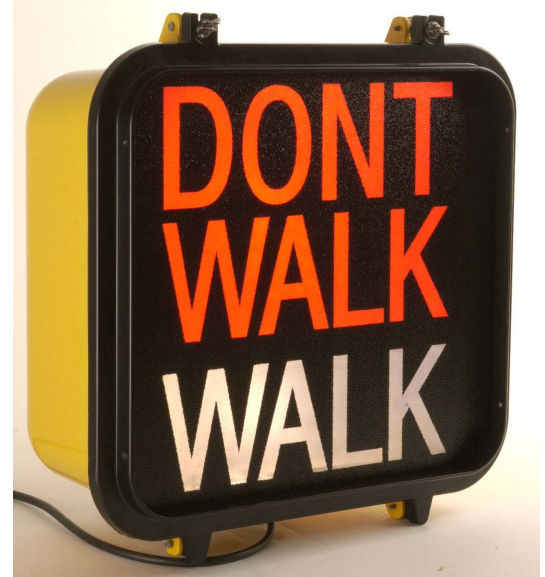
'Walk'/'Dont Walk' Lenses

Sheet aluminum and polycarbonate visors are available in several styles for vehicle and pedestrian signals. The cutaway type is standard. Tunnel and full-circle styles reduce or eliminate signal visibility from other approach directions. Full-circle visors have a sharp angular beam cut off for signal installations where highly directional beam characteristics are necessary to prevent driver confusion, such as streets intersecting at a very sharp angle. All visors have four, slotted mounting tabs for easy attachment to the signal housing door. All visors are flat black on the inside.